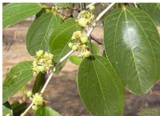
Figure 2: Leaves of Ziziphus spina Christi

The leaves of Ziziphus spina Christi plant are ovate-lanceolate with an acute or obtuse apex. They are glabrous on their top surfaces and delicately pubescent (Figure 2).