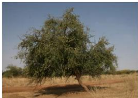
Figure 1: The tree of Ziziphus spina Christi

Fujairah is fifth largest emirates in United Arab Emirates and bears harsh environmental conditions including high temperature, soil salinity, low humidity and water scarcity for irrigation. Such harsh conditions give opportunities to unique kind of plants to grow and provide for required agricultural needs. Ziziphus Spina Christi is one of the native plants from the origin of Fujairah, locally known as Sidr. It is a multipurpose plant belonging to the botanical RHAMNACEAE family. Moreover, Sidr is a medicinal plant with many traditional uses since it has a higher content of minerals, vitamins, and proteins. Sidr has shown medicinal properties and hence been used to treat several illnesses, including liver complaints, insomnia, diabetes, obesity, fever, urinary troubles, digestive disorders, diarrhea, anemia, loss of appetite, etc (Waggas and Al-Hasani 2010).